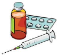
Medic i ne